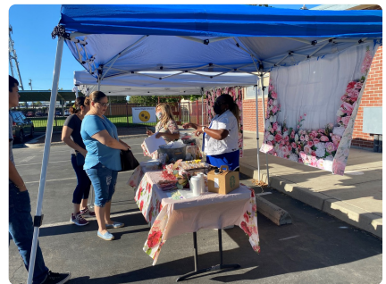
Meet the Principal